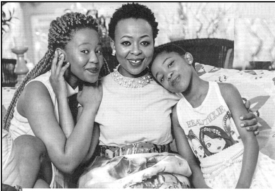
[Itsetfwe ephephabhukwini, i-Drama , lamhla ti-15, Inyoni 2016]